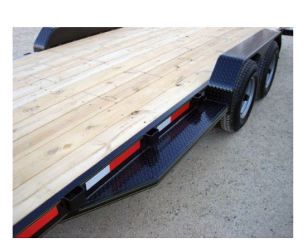
Trailer may be shown with optional equipment. Specifications subject to change without notice.