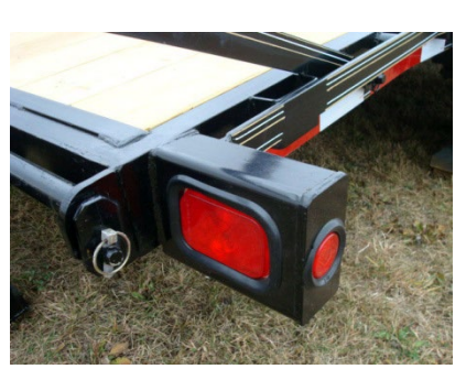
Trailer may be shown with optional equipment.