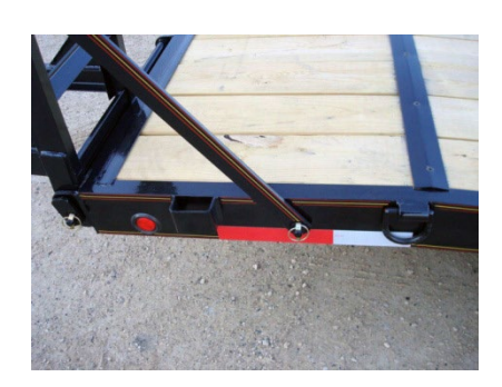
Trailer may be shown with optional equipment. Specifications subject to change without notice.